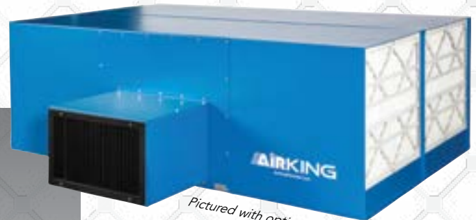
Pictured with optional silencer.

Air King industrial air cleaners are a valuable tool for capturing most airborne nuisance particulate. Our self-contained filtration units continuously pull contaminated air through multiple stages of highly efficient micro-glass filters. The filtered air is then recirculated back into the working environment without the need for duct work. This results in a cleaner, healthier atmosphere for employees, while saving you money by keeping heated or air-conditioned air inside your facility.