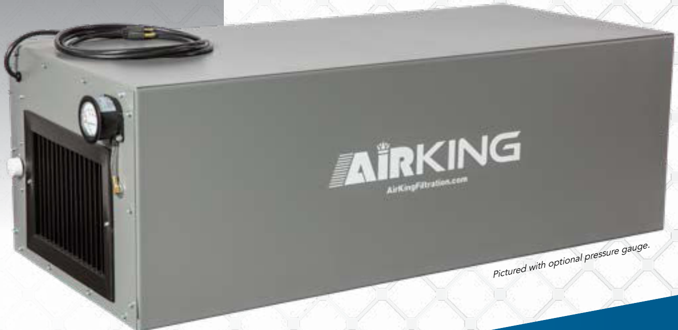
Pictured with optional pressure gauge.