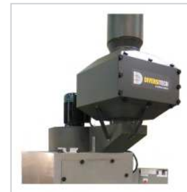
High-efficiency Hepa Afterfilter kit