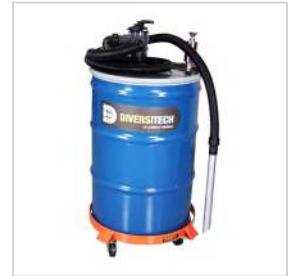
WV-55 Sludge-Vac Removal Vacuum