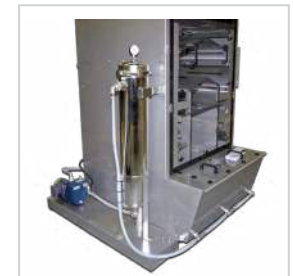
Bag strainer system to remove dust and sludge