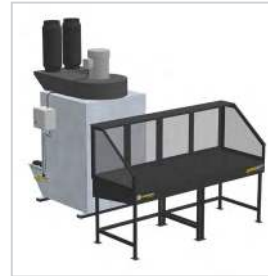
Ducted downdraft table in four standard sizes